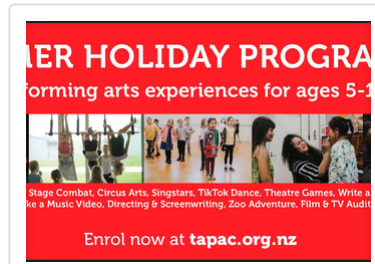
TAPAC HOLIDAY PROGRAMME http://tapac.org.nz