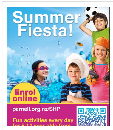
PARNELL TRUST HOLIDAY PROGRAMME parnell.org.nz/SHF