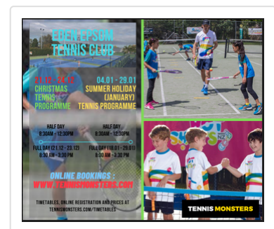
TENNIS MONSTERS http://www.tennismonsters.co.nz