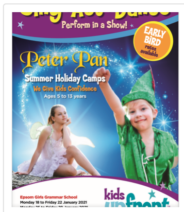
KIDS UP FRONT